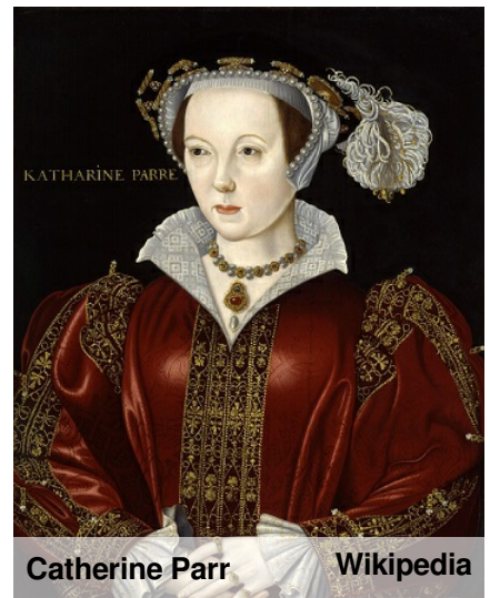
Catherine Parr