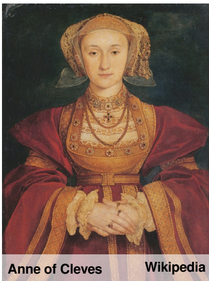
Anne of Cleves Wikipedia