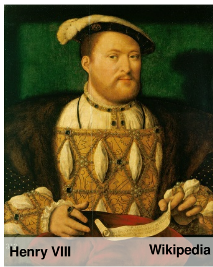
Henry VIII