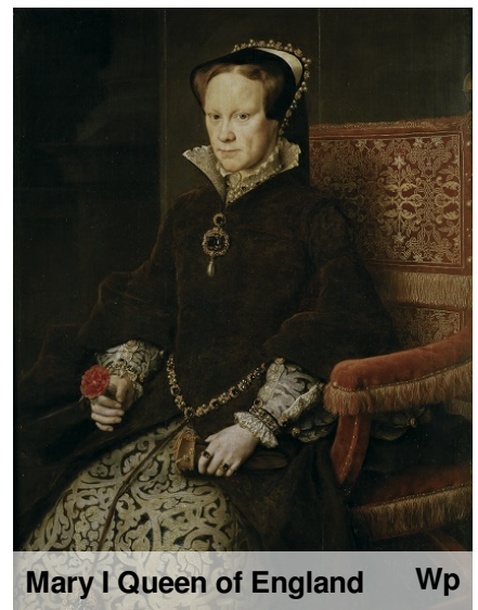
Mary I Queen of England