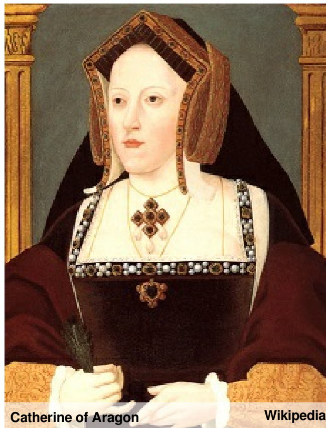
Catherine of Aragon

Henry VIII is one of the most famous people in English history. He was born on 28 th June as the third child of Henry VII and Elizabeth of York. He was the king since 1509 to 1547 and is known as a murderer of his wives. His first wife - Catherine of Aragon was a daughter of the king of Spain and a widow after his brother Arthur. It was a political matrimony. Henry's father wanted to make a coalition with the Spanish king. They had a daughter Mary (the future queen of England - Bloody Mary ), but there was no son so Henry was disappointed. He wanted to get a divorce, so he sent a letter to the Pope, to make him abolish the matrimony, but the Pope refused. That was the reason why Henry separated from the Roman Catholic Church and set up Protestant Church in 1534. Afterwards he exiled Catherine and Mary from court. When Catherine died the king threw a banquet and celebrated her death.