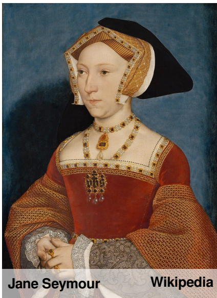
Jane Seymour

During his marriage with Anne Boleyn he fell in love with Jane Seymour . She was his favourite wife because of the fact that she gave him a son - Edward. Unfortunately, she died shortly after having a baby. After Jane's death he was really depressed and a lot of people thought he would never have a wife. However, he was shown a portrait of Anne of Cleves and decided to marry her. She was very good-looking on a portrait but when he saw her he realised she was ugly and got divorced.