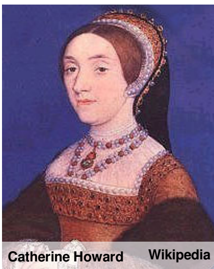
Catherine Howard