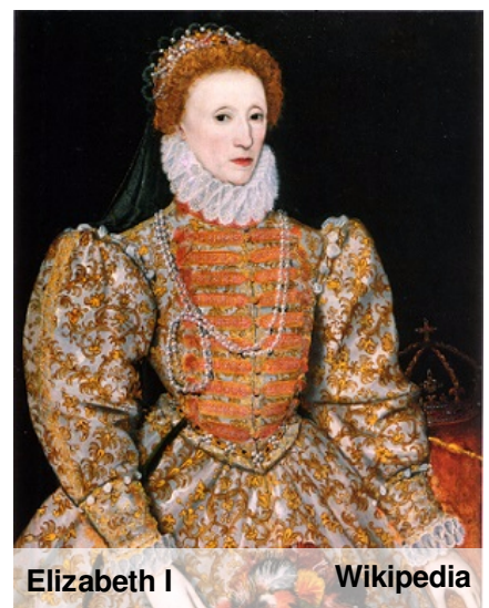
Elizabeth I